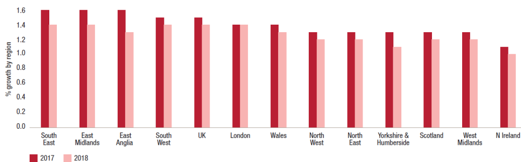
Figure 1 PwC main scenario for output growth by region in 2017 and 2018