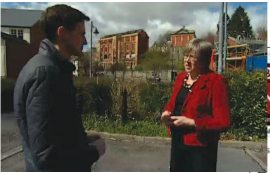
Bevan Foundation Director talks to Channel 4 News

Its findings on equality have shaped the work of the Equality and Human Rights Commission and its partners, those on co-operatives have increased the profile of co-operatives in Welsh economic policy whilst its work on regeneration has informed the development of policies by the Big Lottery Fund and others.