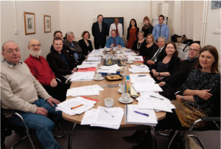
Trustees and staff at the Annual General Meeting